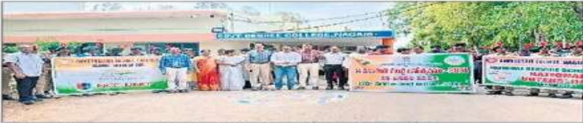
నగరిలో నిర్వహిస్తున్న ఓటర్ల దినోత్సవ ర్యాలీ

26/01/2024 | Chittoor(Nagari) | Page : 3