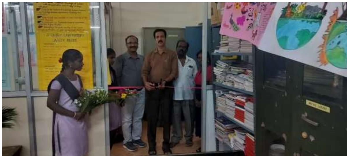
Opening of Poster gallery by Principal