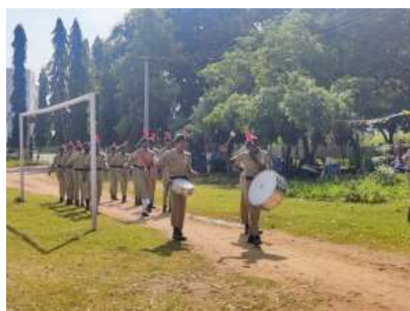
Guard of Honour