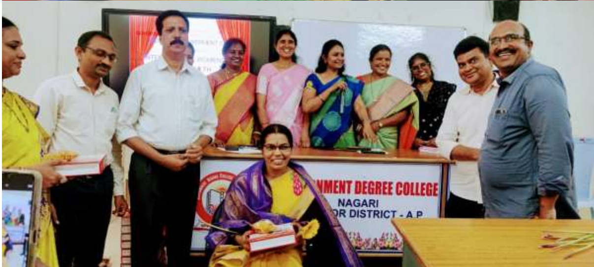
Felicitation to the lady staff members