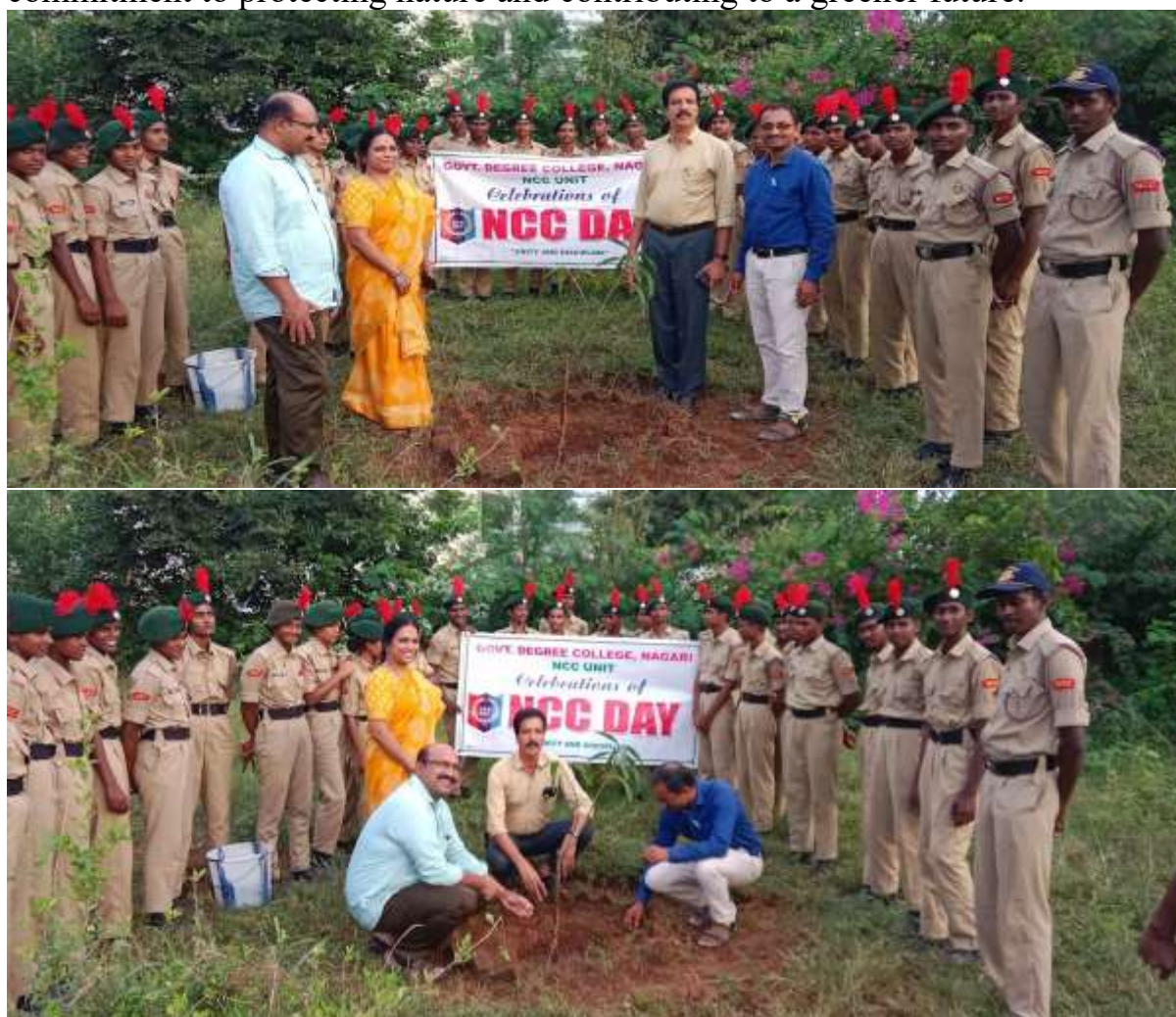
Principal, Vice-Principal, NCC ANO & IQAC Coordinator planting saplings

A tree plantation drive was organized as part of the celebrations to promote environmental awareness and sustainability. NCC cadets, along with the dignitaries, planted saplings on the college premises, reinforcing their commitment to protecting nature and contributing to a greener future.