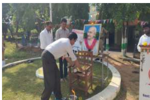
Principal paying homage to the Father of the Nation