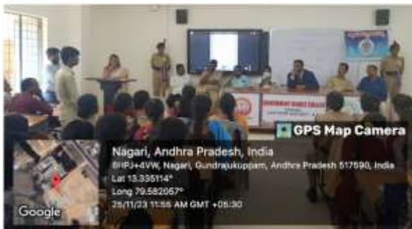
Honourable Judge interaction with the students