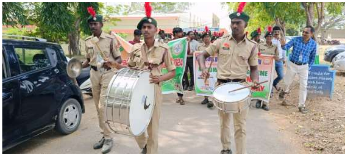
Drums by the NCC Cadets to grab the attention of the Public