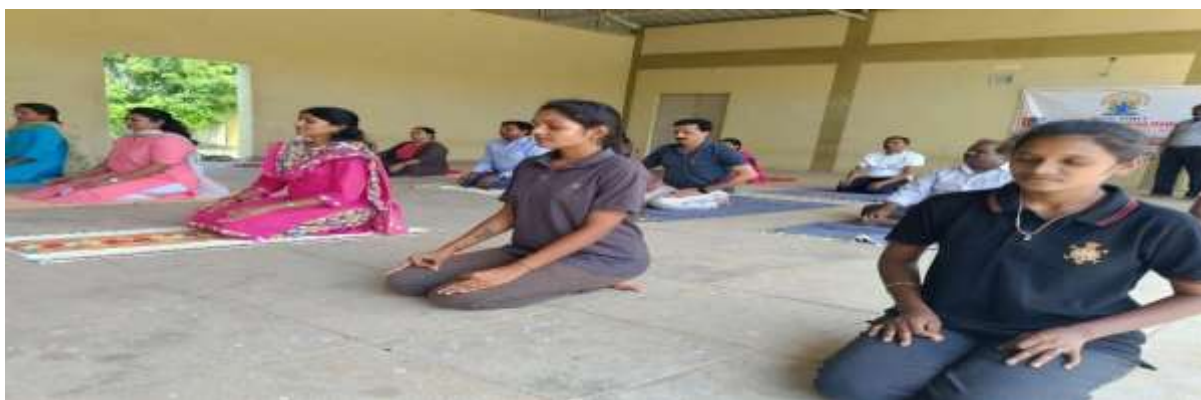
Instructor, Staff, NSS Volunteers and Students