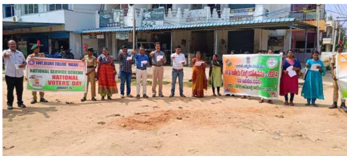
Human Chain formed to take the Voters Day Pledge.