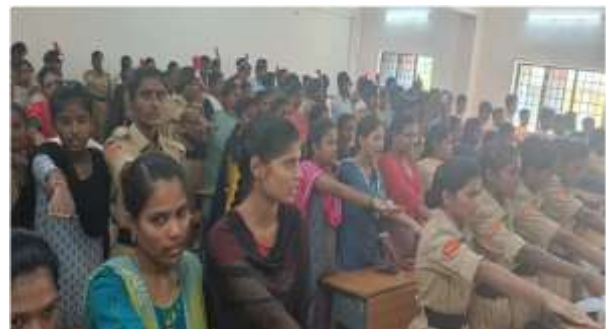
Oath taking by the staff and students