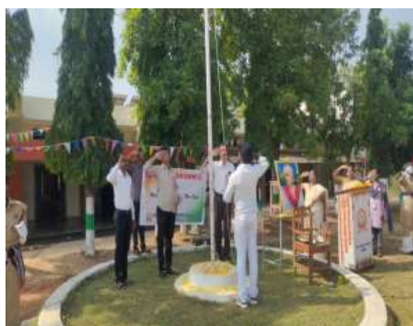
Saluting the National Flag