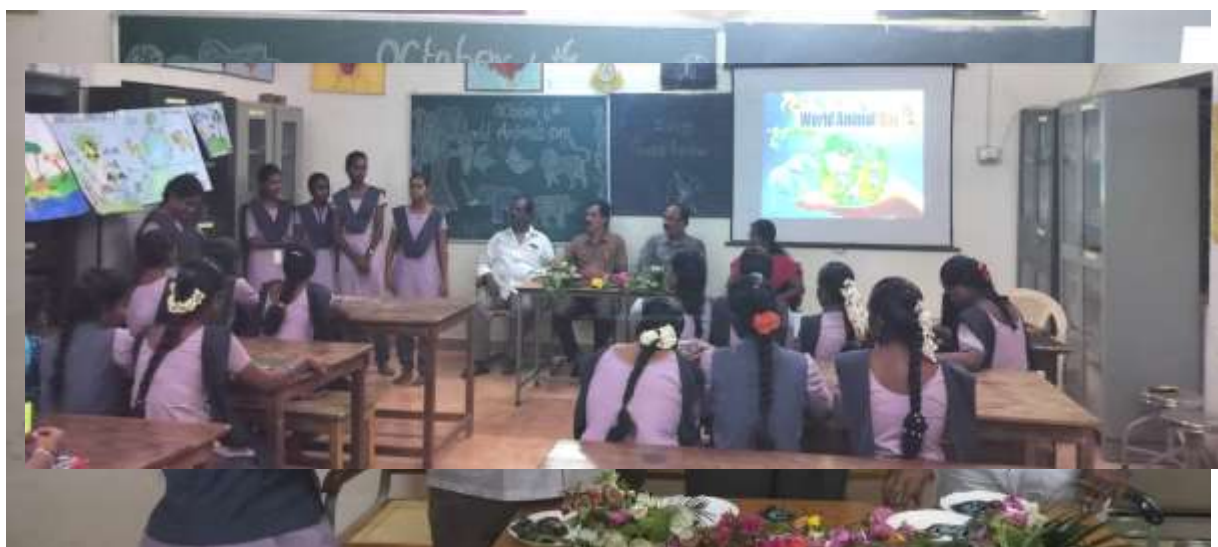
Quiz Competition winners - B.A students organized by B.SC students