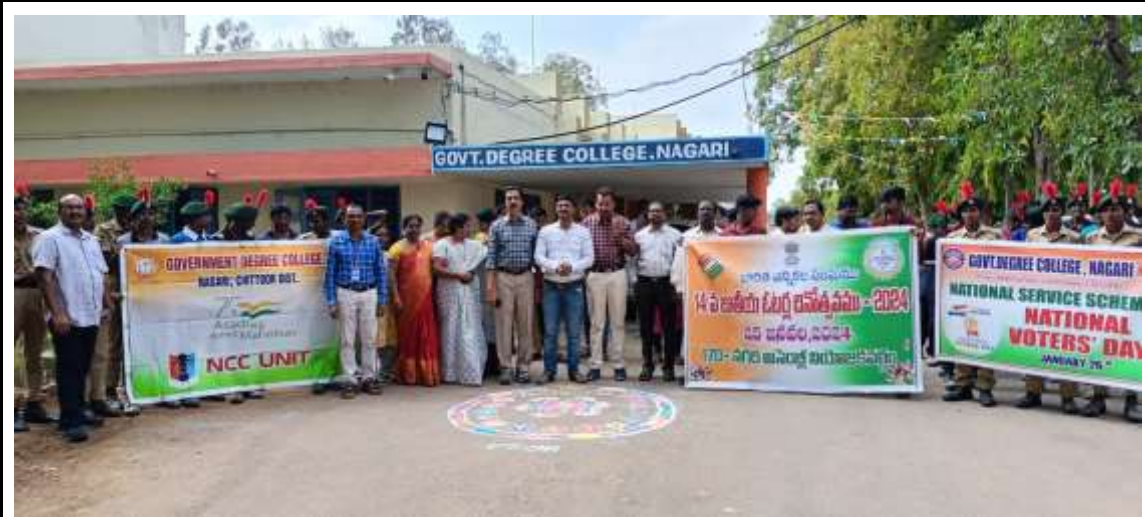
Addressing by the Mandal Revenue Officer, Nagari