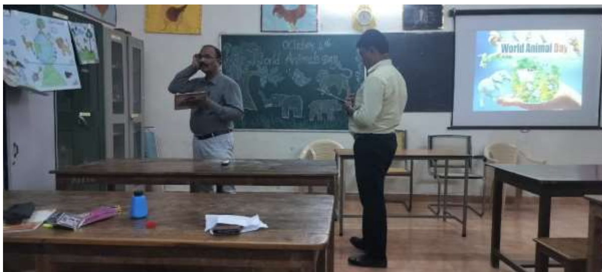
Judges giving marks