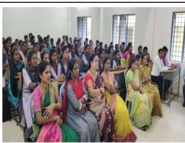
Staff and students attending the programme