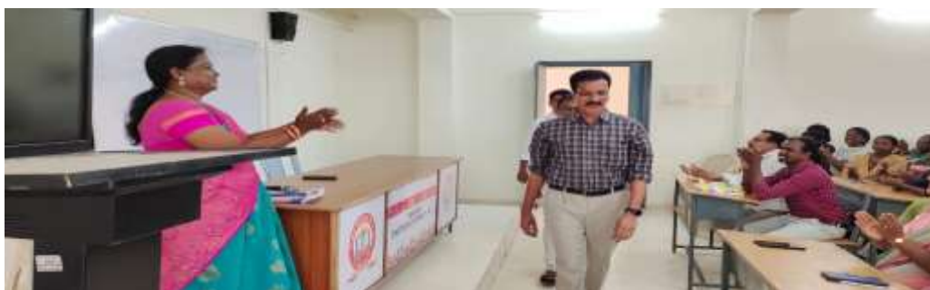
Fashion show by the faculty