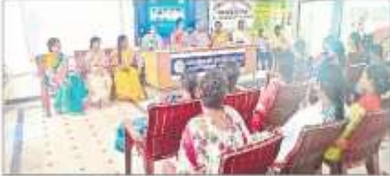
మూల్యారుతున్న వైద్యులకారితో దాద్రే శ్రీతిథ్యాగం