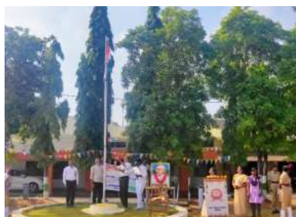
Flag Hoisting by the principal